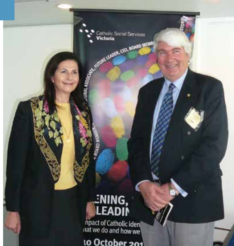
Senator the Hon Concetta Fierravanti-Wells and Fr Frank Brennan JS AO at the launch of 'Listening, Learning and Leading'

The pair discussed the programme's successes and held up the Good Shepherd's alternative education programme as an example. Members also talked about Indigenous incarceration, methamphetamine usage, work development orders, and the gap in support for young people leaving school.