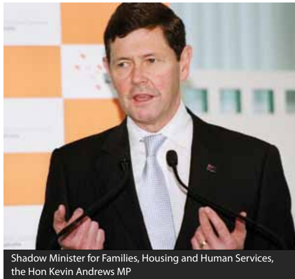
Shadow Minister for Families, Housing and Human Services, the Hon Kevin Andrews MP

01/02/2012 A Major Step Forward for Community Workers