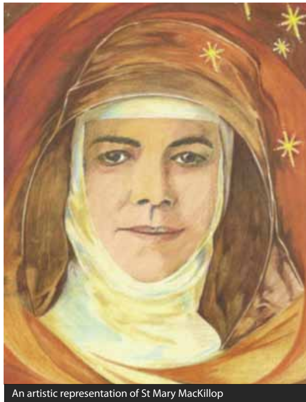
An artistic representation of St Mary MacKillop

Our October 2011 conference on the influence of Mary MacKillop on Catholic social services in Australia invited participants to go more deeply into Mary's life and the work that she continues to inspire, to explore her influence today and beyond. Papers and other links from the conference are available on our website - www.css.org.au/MaryMacKillop .