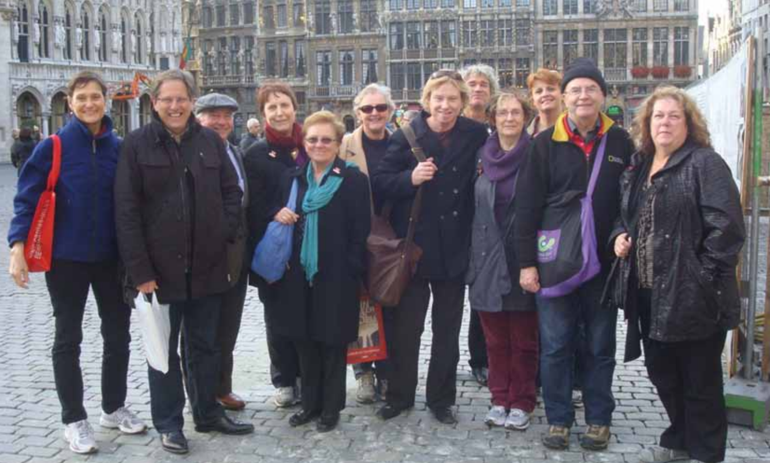
2011 Leuven Group in Brussels